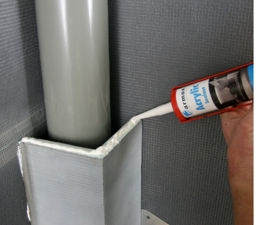
6 Place the Marmox pipe boxing in place and push firmly. Add screw fix-ings. Run a bead of Marmox MSP360 around the top.

5 This example shows being fitted in the corner against a stud wall and solid wall. Be sure to mark against the wall and drill out the hole positions.