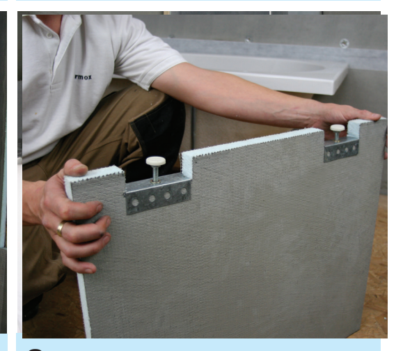
8 You can seal the edges with Marmox MSP360. The Marmox pipe boxing is now ready to be plastered or tiled.