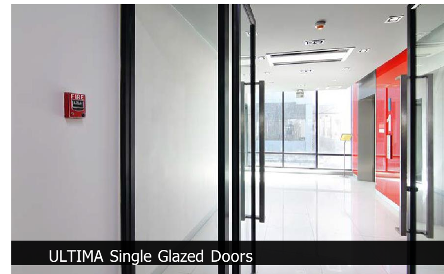
ULTIMA Single Glazed Doors