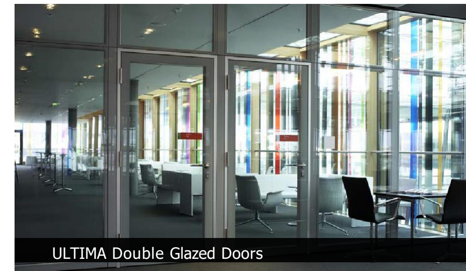
ULTIMA Double Glazed Doors