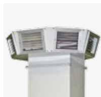
8-DIRECTION AIR DIFFUSER WITH SINGLE-DEFLECTION GRILLS ON THE BRIS MANN MODEL.