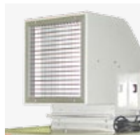
DOUBLE-DEFLECTION GRILLS ON THE FRESC MANN MODEL.