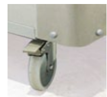
NYLON WHEELS FOR MOBILITY.