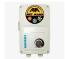
PANEL DE CONTROL FRONTAL DE FRONT CONTROL PANEL, 1-SPEED OR VARIABLE FLOW.