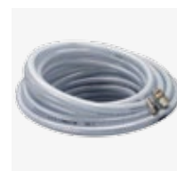
QUICK-CONNECT HOSE FOR CONNECTION TO WATER SOURCE.