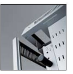
Quick Release Front Door Housing

The HDPF comes complete with 12 tubular side cable management arms allowing ease of patching from side to side.