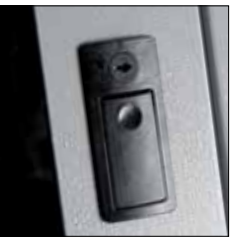
Slam latch locking mechanism