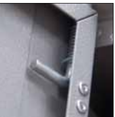
Quick release hinge system provides maximum space during installation