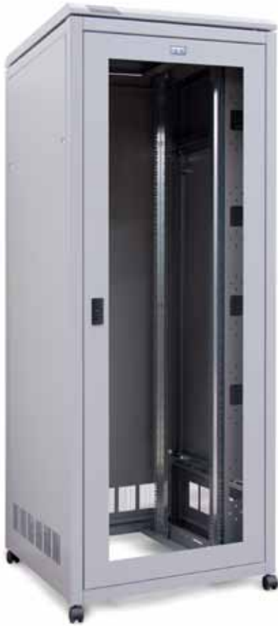
Model Shown: CAB4288