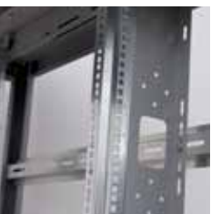
Vertical cable management On 800mm wide enclosures