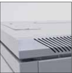
Multiple cable access points fitted

It's design has evolved from continuous development with today's installation teams.