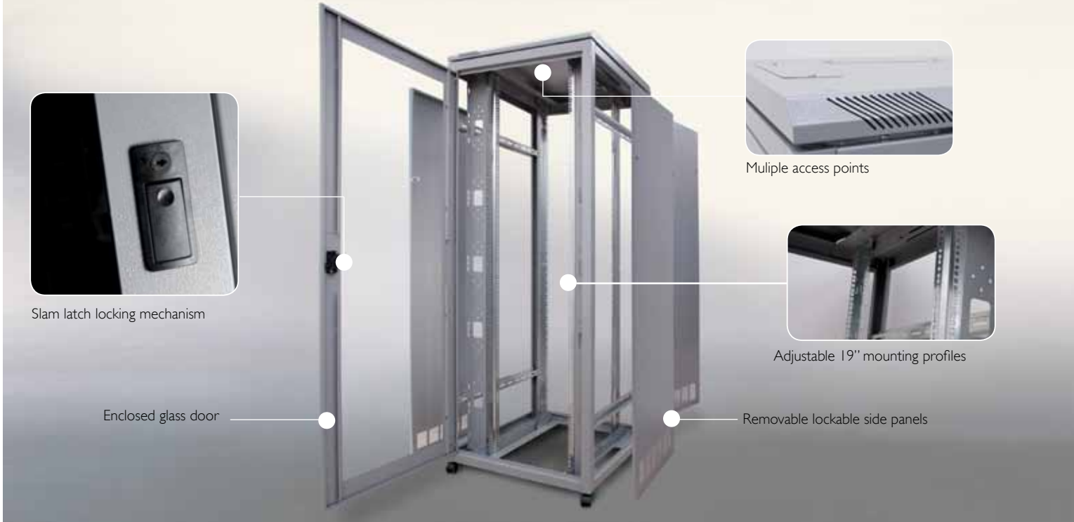
Multiple access points