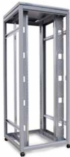
Bolted steel frame chassis