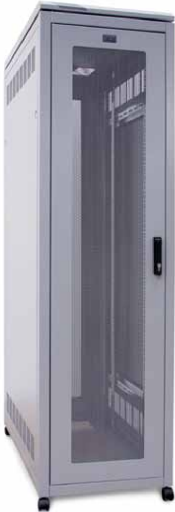
Model Shown: CAB4268