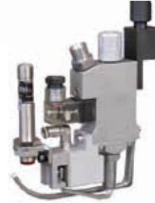
Model ERO GTE-13