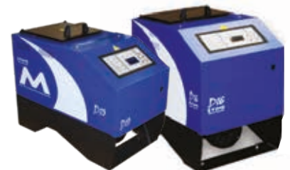
D10 & D16 Melt Units

We offer a range of hot melt units, gear pump driven or piston pump, with melt rates from 10 lbs (5kg) /hr to 300 lbs (135 kgs) lbs/hr. Systems also available for use with PUR reactive hot melt formulas.