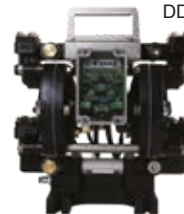
DD-1 Pump For Cold Glue

Choose from piston pump, diaphragm pump or a selection of stainless-steel tanks. Our precision, pressure-balancing glue regulators provide consistent adhesive volume as machine speed increases or decreases.