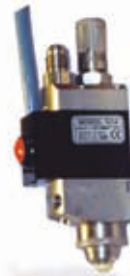
Model 524 Valve