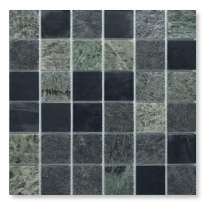
5cm x 5cm