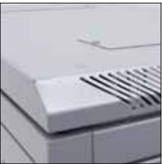
Multiple roof access points

of this cabinet provides multiple cable entry positions and can also be partnered with cold aisle and overhead race way solutions.