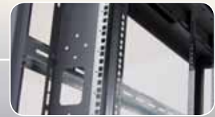
Adjustable 19" mounting profiles