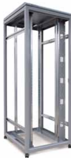
Bolted steel frame chassis with high load capacity

A full range of door variants are available