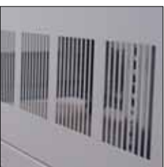
Vented side panels top and bottom