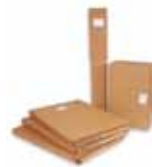
Flat pack option