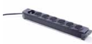
Intelligent power distribution units