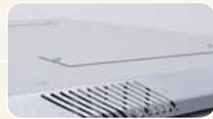
Multiple access points