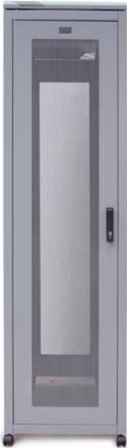
Model shown: CAB42610/SVR