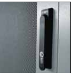
Lever latch locking mechanism