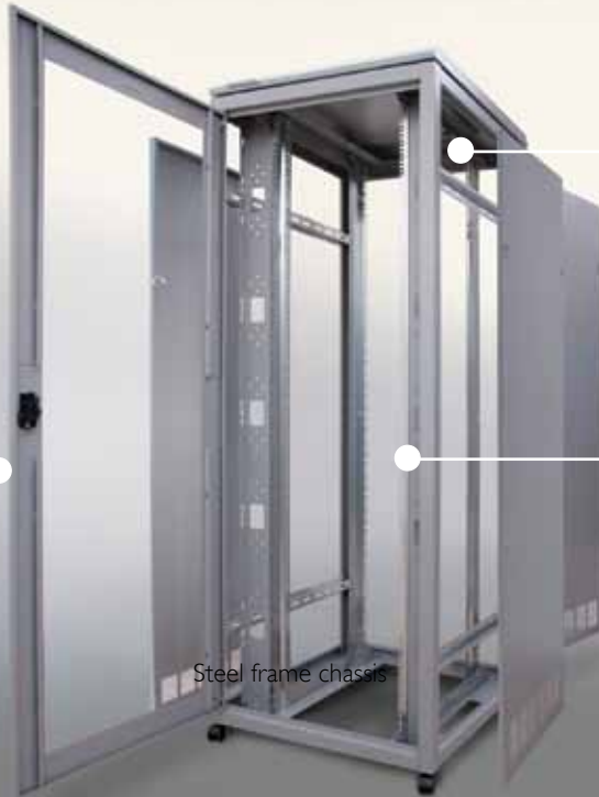
Steel frame chassis