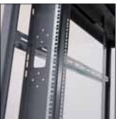
Vendor neutral adjustable mounting profiles