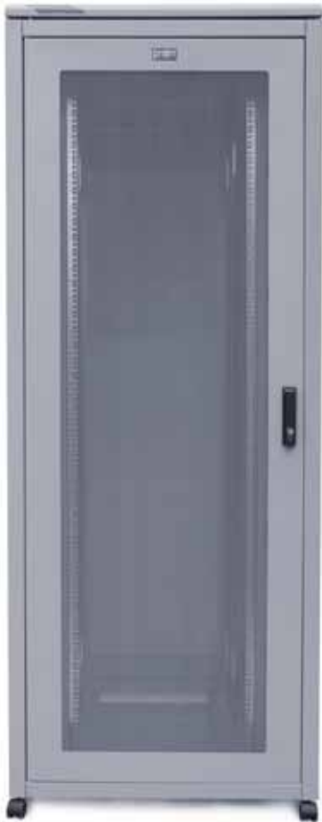
Model shown: CAB42810/