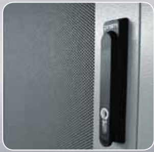
Lever latch 3 point locking